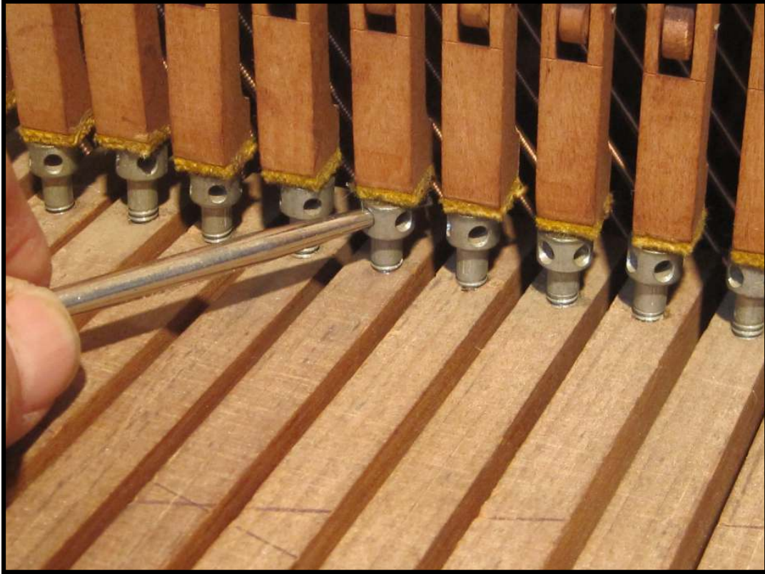
Capstans are adjusted to take up lost motion.

"In business to bring your piano to its full potential."